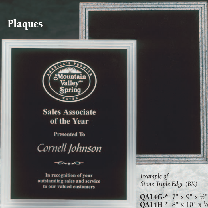
Example of Frosted Triple Edge (CL)