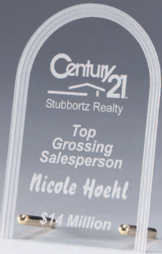
Example of Frosted Triple Edge (CL)

A versatile acrylic series featuring clocks, plaques and desk items. These awards are available in an eye-catching gray granite Stone Triple Edge or Frosted Triple Edge