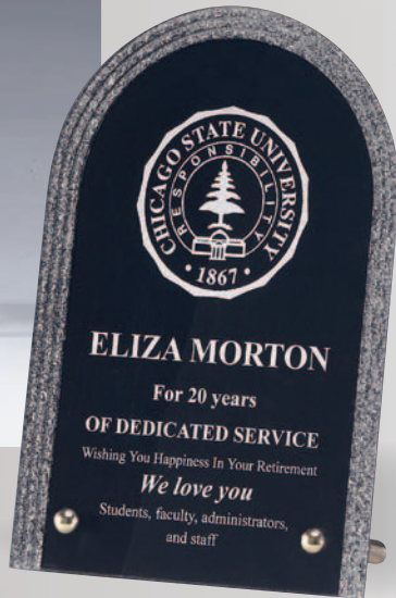
Example of Stone Triple Edge (BK)

Stand Up Awards ¼" acrylic awards with solid brass posts