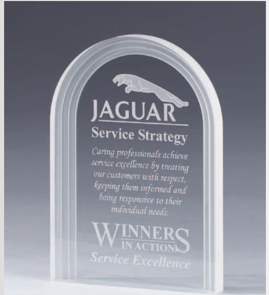
Example of Frosted Triple Edge (CL)

Stand Up Awards Shaped acrylic in Stone Edge or clear Frosted Triple Edge