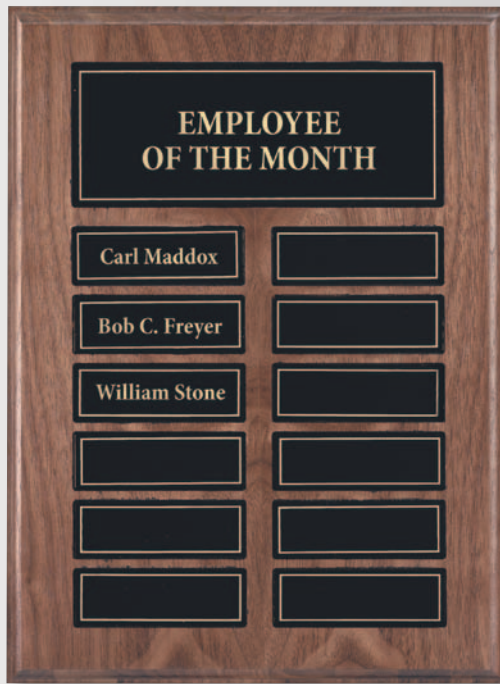
12 Plate perpetual plaque 8" x 10" QPP200B-BK / Black engraving plates QPP225B-BL / Blue Marble engraving plates

These plaques are made from hand-rubbed American Walnut veneer.