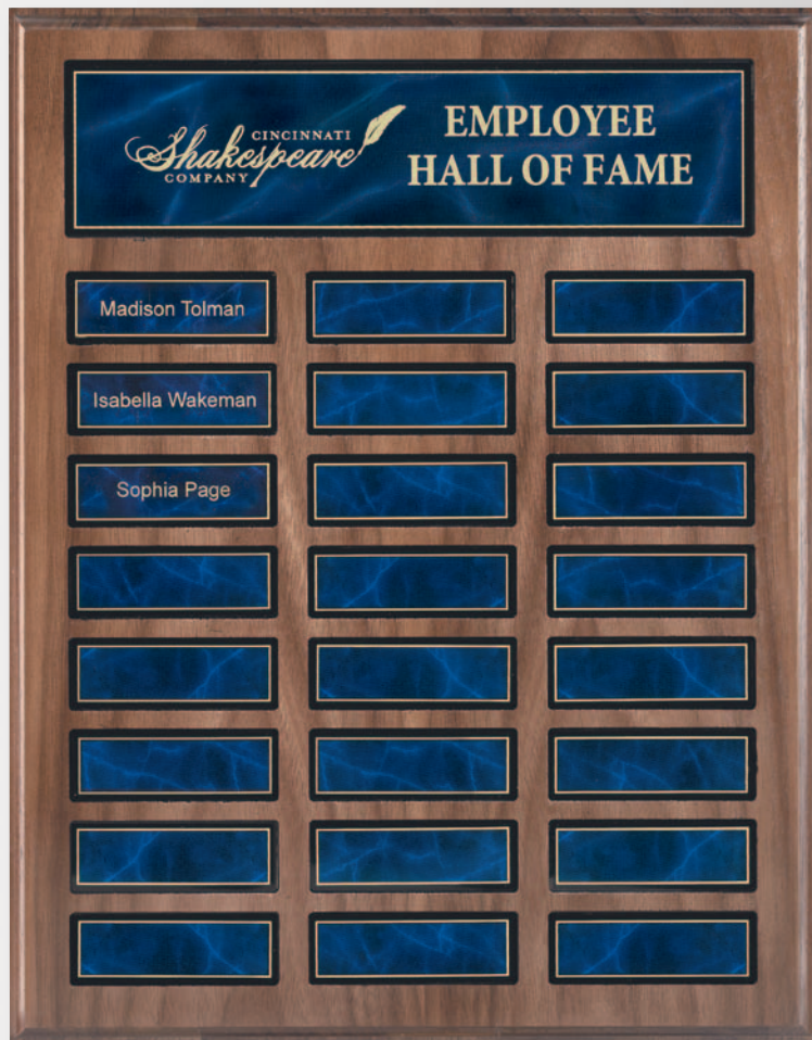
24 Plate perpetual plaque 12" x 15" QPP200D-BK / Black engraving plates QPP225D-BL / Blue Marble engraving plates

Recognition Pocket™ Perpetual Plaques are designed for laser engraving.