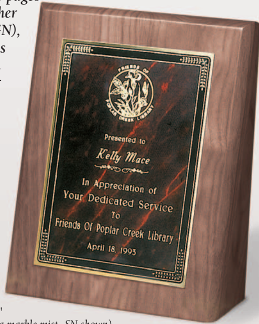
QP25T-* 7" x 9" *Specify color (Sienna marble mist -SN shown)

Enhance your award programs with the classic designs of hand rubbed American walnut and Marble Mist solid brass engraving plates. All awards on these pages are available in either blue (BL), green (GN), sienna (SN) or gloss black (BK) finishes. Please specify color when ordering.