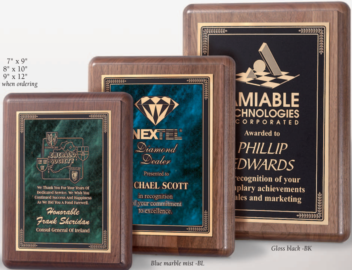
Green marble mist -GN