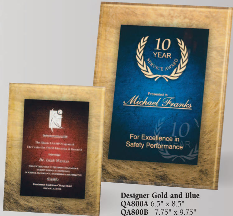
Designer Gold and Burgundy QA801A 6.5" x 8.5" QA801B 7.75" x 9.75" QA801C 8.75" x 11.75"