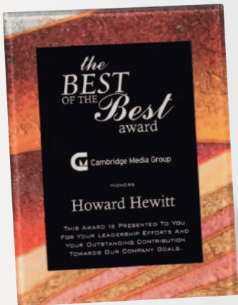
Autumn Harvest QA804A 6.5" x 8.5" QA804B 7.75" x 9.75" QA804C 8.75" x 11.75"

Easel/hanger back designed for either a wall plaque or desk award.