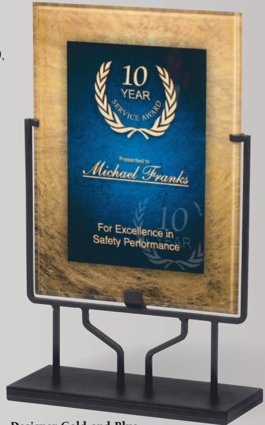
Designer Gold and Blue QA800H-C 9½" x 15"