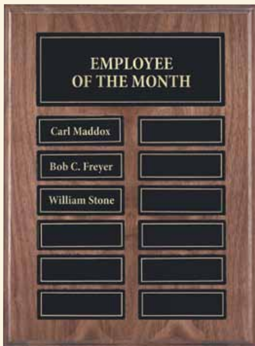
12 Plate perpetual plaque 8" x 10" QPP200B-BK / Black engraving plates QPP225B-BL / Blue Marble engraving plates

These plaques are made from hand-rubbed American Walnut veneer.